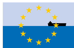
European Shortsea Network