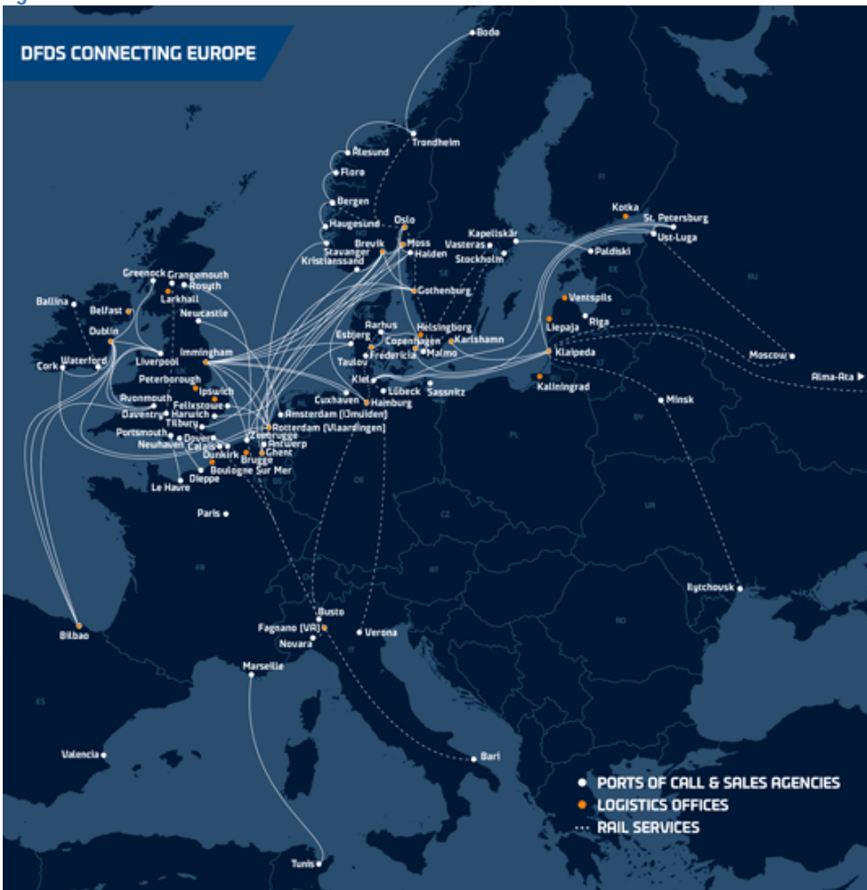
Figur 2 DFDS Services