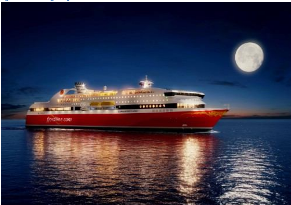
Figur 10 MS Bergensfjord