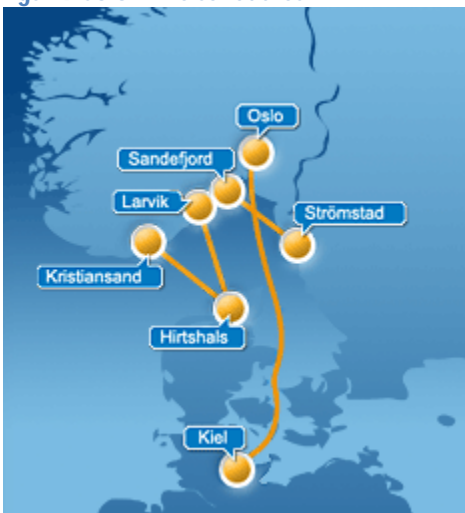
Figur 9 Color Line schedules