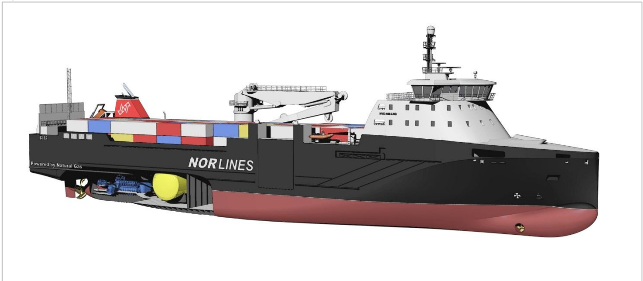
Figur 11 Nor Lines Enviroship