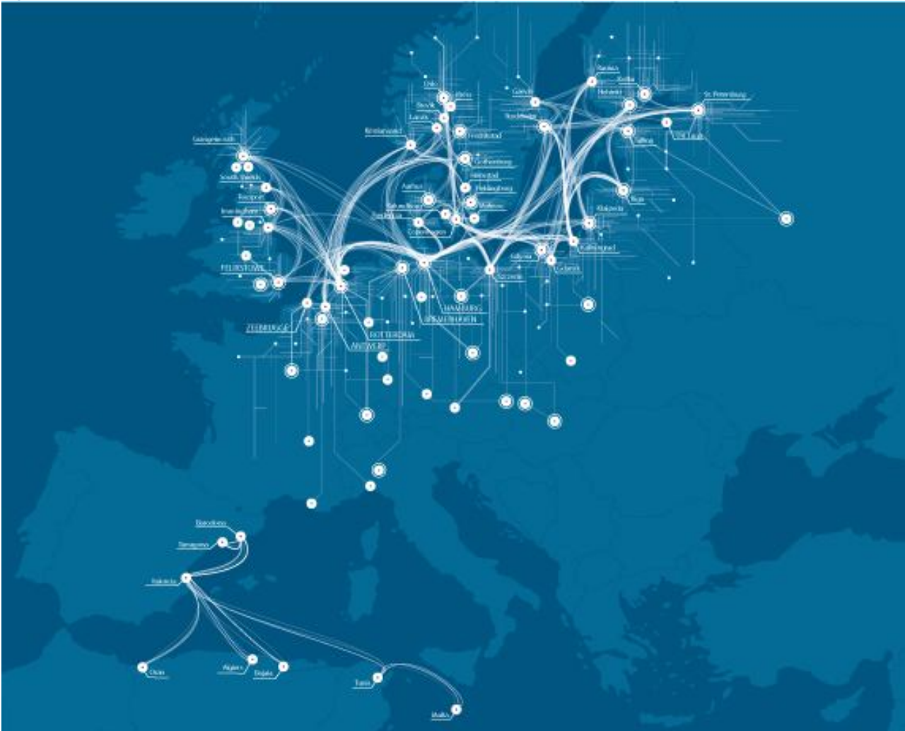
Figur 5 Unifeeder services