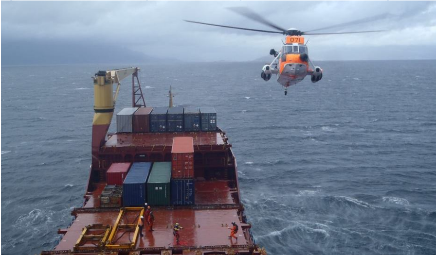
Figur 12 MV Rita on her way to Salten - Todays exercise with the Norwegian Rescue Forces from Bodø