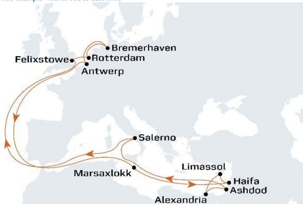
Figur 4 Seago Line Service example - North Sea to East Med