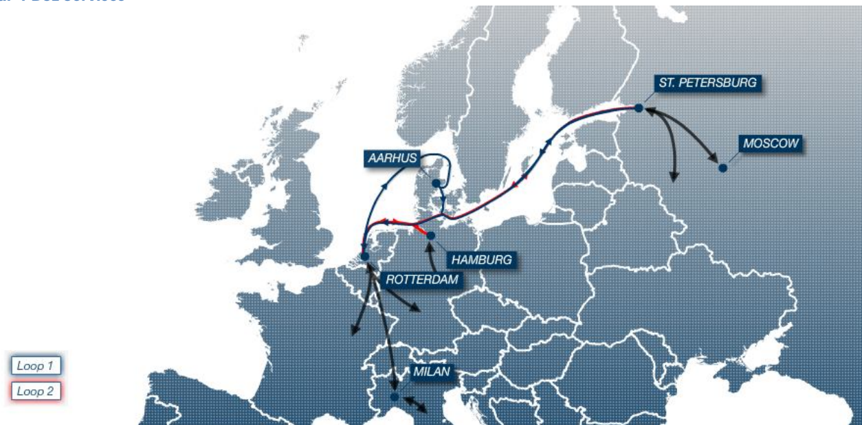
Figur 1 DSL Services