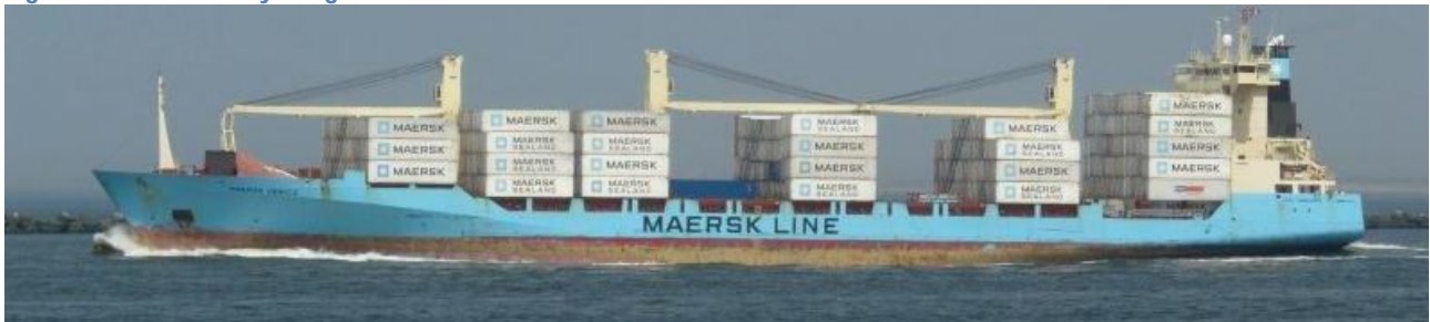
Figur 3 Vessel used by Seago Line in North Sea – East Med Service